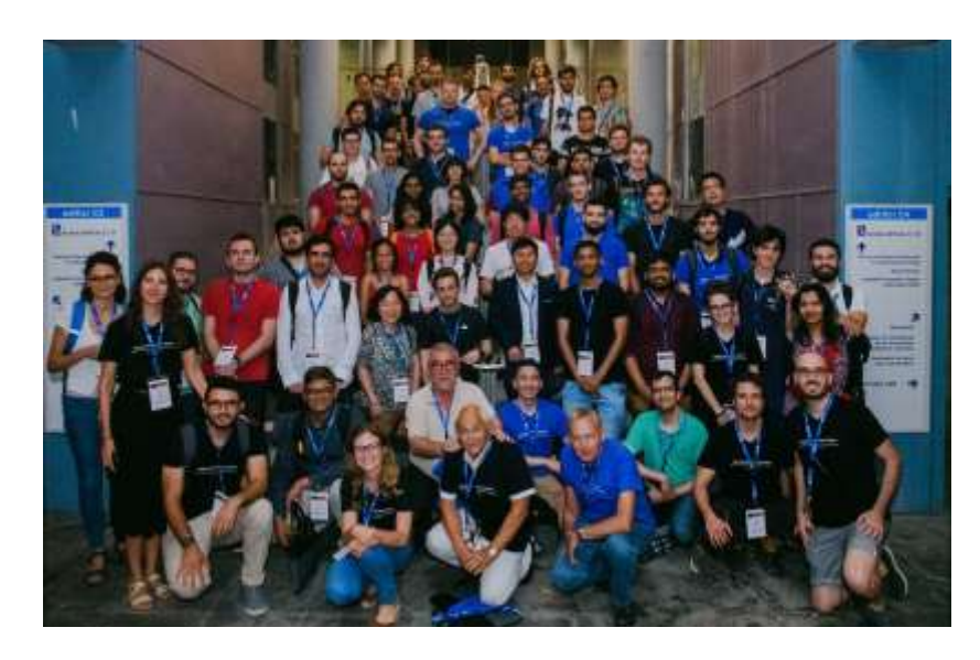
Figure 6: 1<sup>st</sup> ACM Summer School on HPC Computer Architectures for AI and Dedicated Applications, held in Barcelona, Spain, in July 2019.

The 2019 ACM Europe Summer "HPC School on Computer Architectures for AI and Dedicated Applications" took place Barcelona 17 - 24 July 2019, and was hosted by the Barcelona Supercomputing Center (BSCand the CNS) Universitat Politècnica de Catalunya (UPC-BarcelonaTECH). ACM's Special Interest Group High on Performance Computing (SIGHPC), devoted exclusively to the needs of students, faculty, researchers, and practitioners in high performance computing, was the primary sponsor of the school.