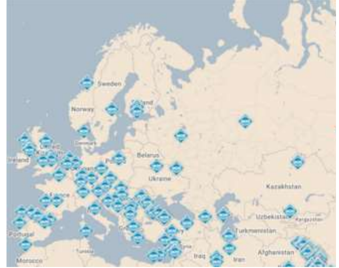
Figure 3: ACM Chapters in Europe

CECL following its strategy, actively supported ACM events in Europe (ACM Summer schools in Europe, womENcourage 2019 and 2020). It also continued its mentoring efforts to new and old ACM chapters in Europe even visiting physically several of them. in order to identify the needs of ACM Europe members, CECL performs a qualitative study on the